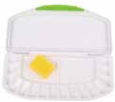
Plastic Watercolour Palette Small (16 Wells)