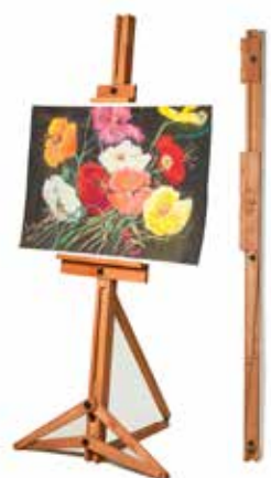
AS Gibraltar Easel