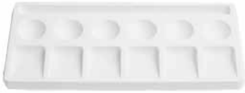
NO. 1 Palette