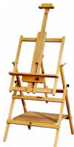
AS Studio Easel - Large