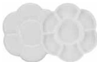
Glazed Porcelain Flower Palette (3 Sizes)