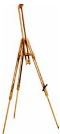
AS Field Easel