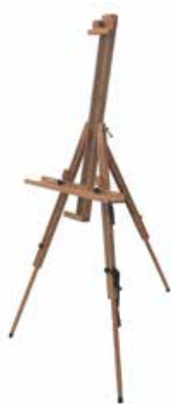
AS Field Easel With Tray