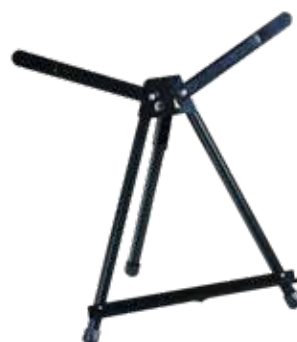
AS Aluminium Compact Table Top Easel