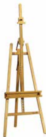
AS Lyra Easel