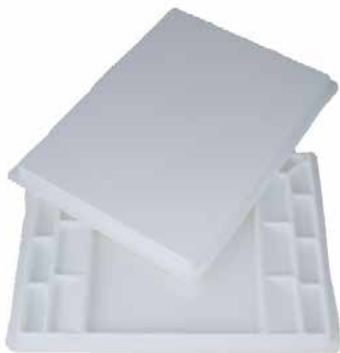
Art Spectrum® Big Brush Palette