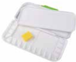
Plastic Watercolour Palette Medium (18 Wells)