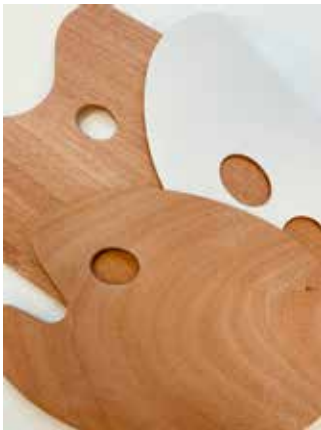
Wooden and Melamine Palettes