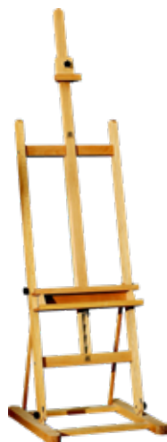
AS Studio Easel