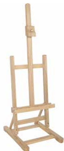
AS Large Table Top Easel