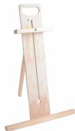
AS Table Top Easel & Carrier