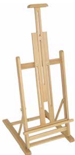
AS Small Compact Table Top Easel

Art Spectrum® easels are all made to the highest quality from oiled European beach wood. All fittings are brass and leather for a long lasting and beautiful finish.