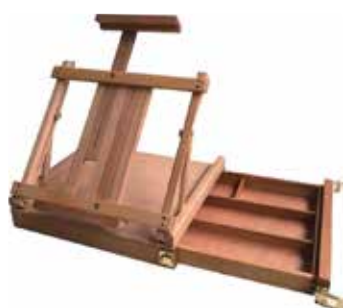
AS Table Top Easel With Draw