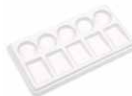
Glazed Porcelain Slant Palette