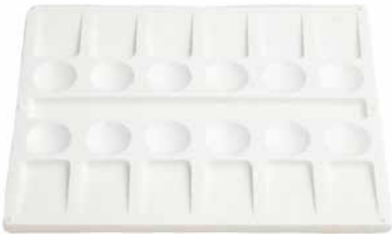
NO. 2 Palette