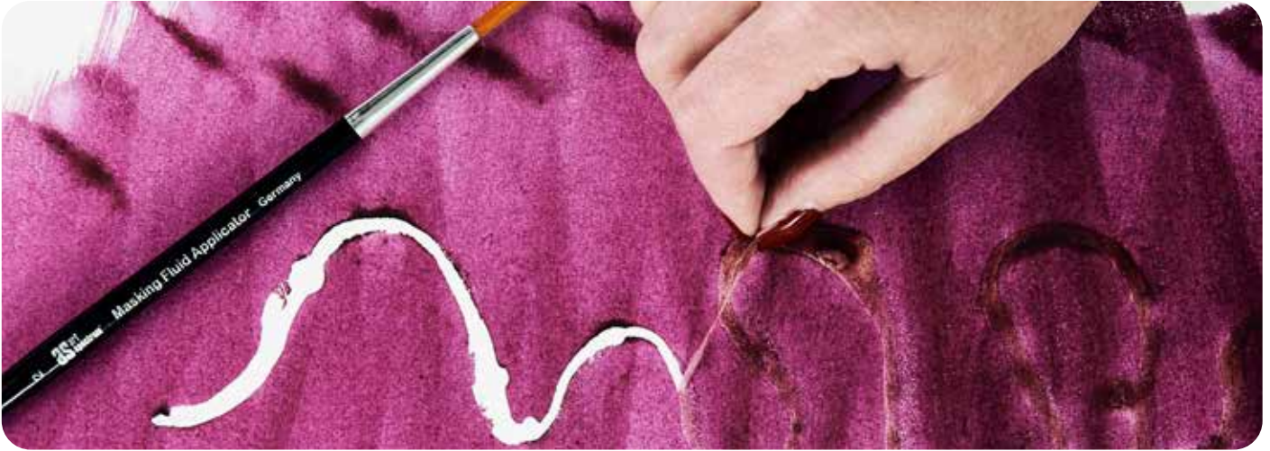
Table of Contents - Tools