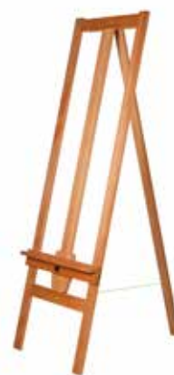
AS Drawing & Painting Easel