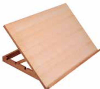
AS Table Top Easel Draw A3 & A2