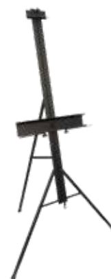
AS Aluminium Studio Easel