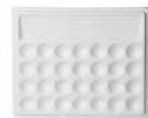
Glazed Porcelain 28 Well Palette