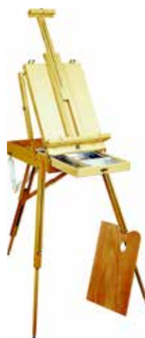
AS Studio French Sketch Box Easel