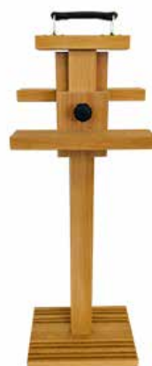
AS Wet Canvas and Panel Carrier