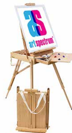
AS Artist Large French Style Box Easel