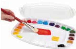
Plastic Watercolour Palette Large (23 Wells)