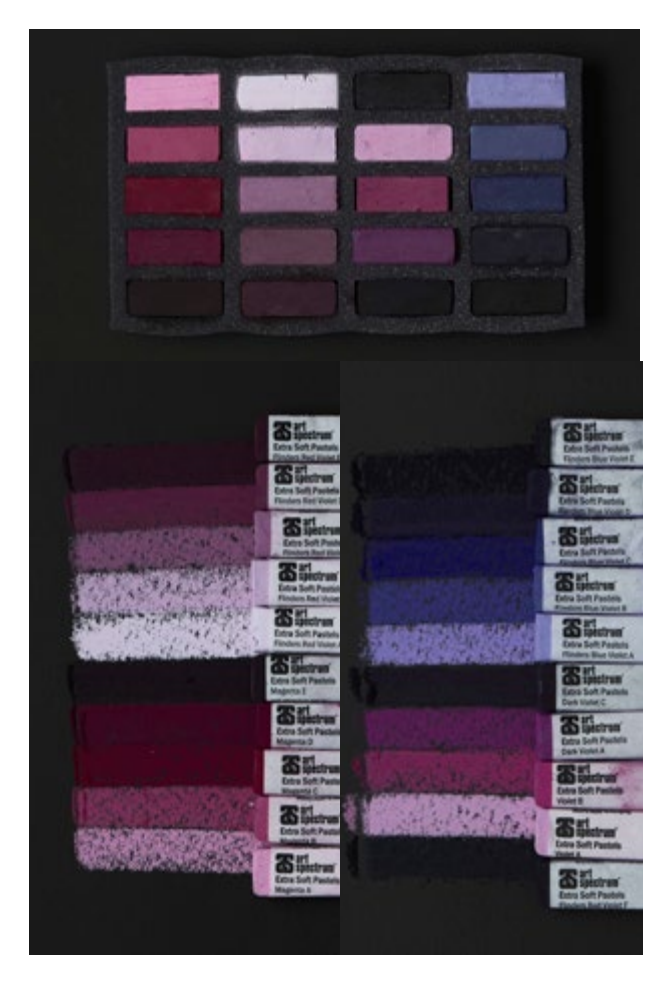
SQP25 - Violets