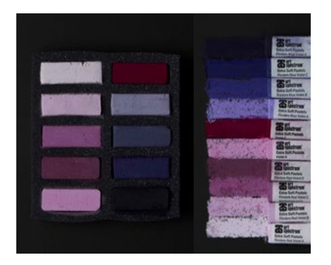
SQP4 - Violets