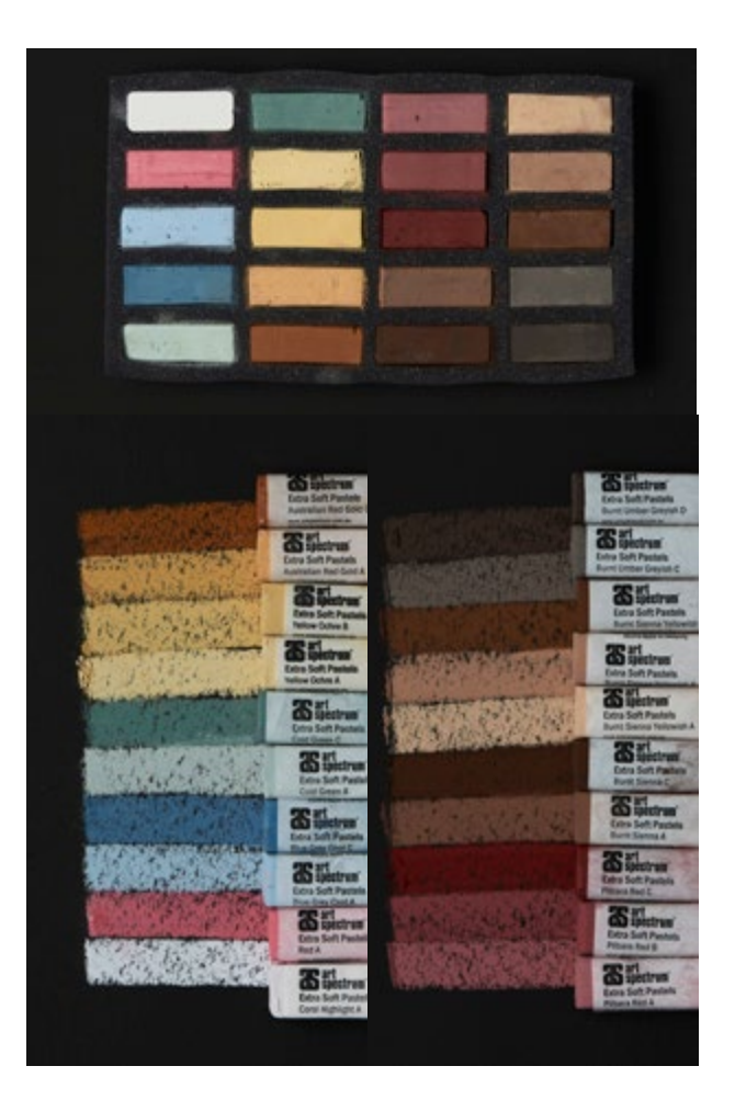
SQP23 - Portrait